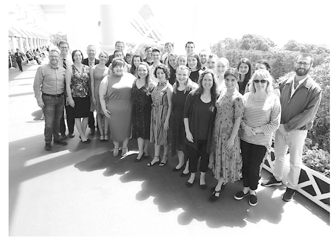
Along with performing at Crooked Tree Arts Center this summer, the students of the Up North Vocal Institute will again perform at the Grand Hotel on Mackinac Island.

This summer, along with their various performances spanning from Mackinac Island to Boyne City, the 2018 Up North Vocal Institute (UNVI) will perform five times at Crooked Tree Arts Center in Petoskey. These concerts provide entertainment for music enthusiasts, as well as a chance for the singers to showcase what they've learned during their opera boot camp.