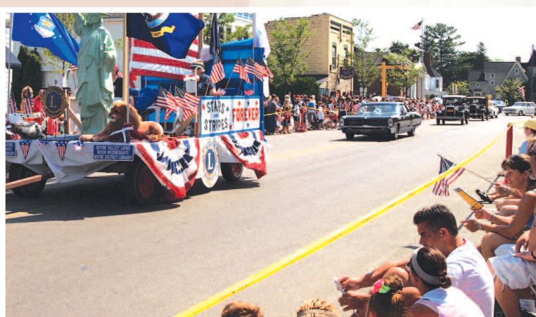
An action-packed Boyne City 4th of July Festival fun begins on Tuesday, July 3, and the Grand Parade and many other activities will take place on Wednesday, July 4th.