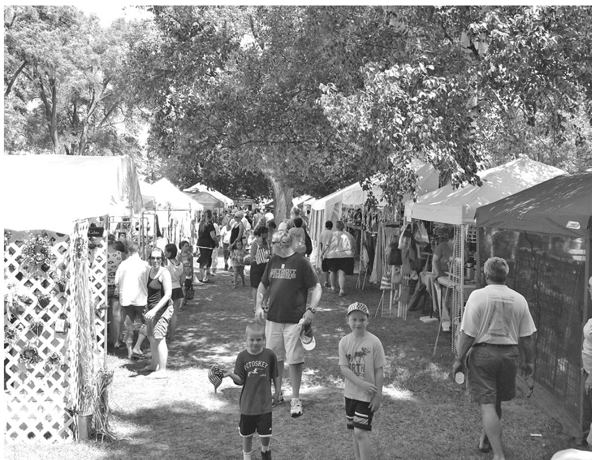
The 42nd Annual Waterside Arts & Crafts Show, always a popular stop among festival goers, will take place in Veteran's Memorial Park from 10am until 5pm on Tuesday and Wednesday.

Lineup sponsored by Boyne City McDonald's: Judging is at 9:30am sharp. Early Education Building Playground on the corner of Main and Park streets.