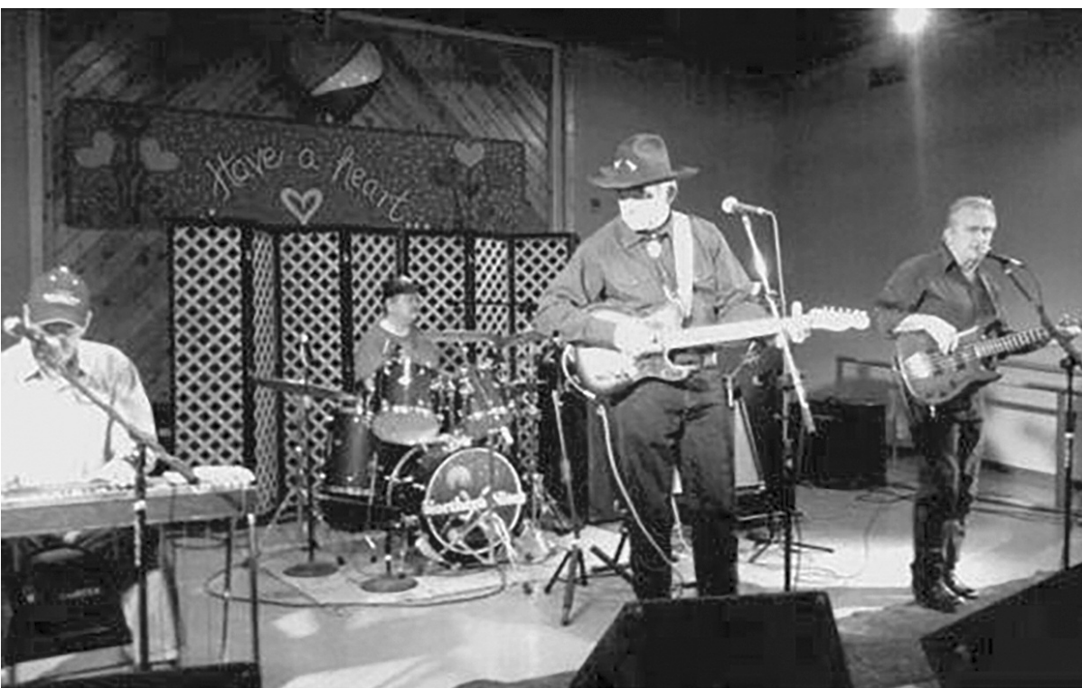
The Northern Nites Band, featuring classic country, new country and some old time rock-n-roll, will perform on Friday night on the Main Stage.

8 PM - All EJHS Alumni Class Reunion - E.J. Tourist Park Pavilion - Sponsored by Class of 1978