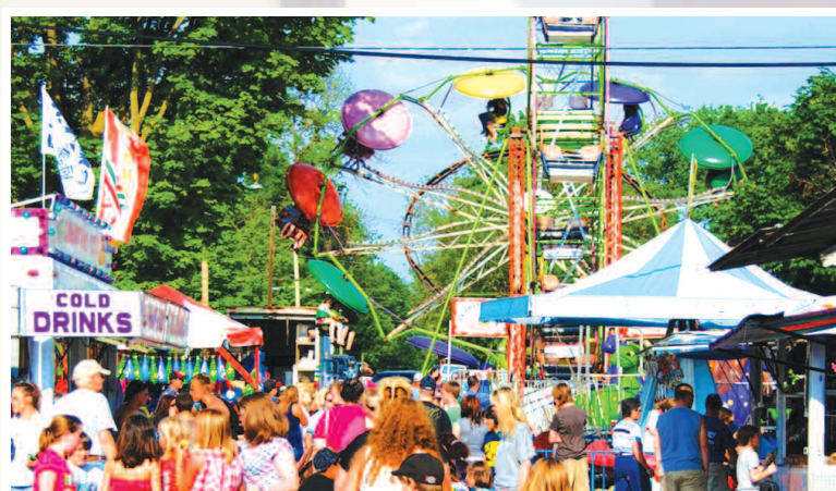
The 2018 East Jordan Freedom Festival is underway in the community of East Jordan. The annual event will run through July 1, and features activities and entertainment for the entire family and for all ages.

T he 2018 East Jordan Freedom Festival is underway in the community of East Jordan. The annual event will run through July 1 and features activities and entertainment for the entire family and for all ages. The fun includes a youth and a grand parade, Friday Night Block Party, free kids games in the park, 3-on-3 Basketball Tournament, Co-ed Grass Volleyball Tournament, farmers market, carnival, raffle drawings and more.