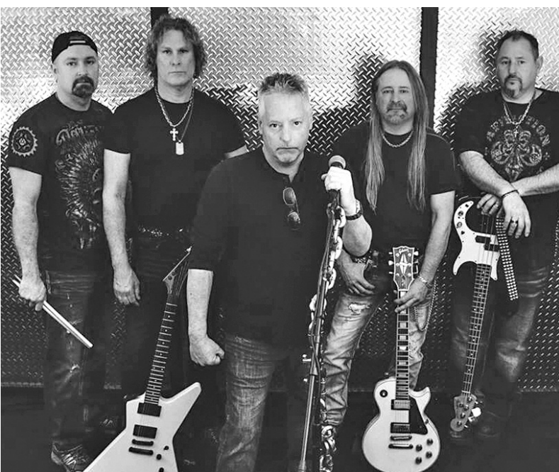
Derailed will be among the bands performing live at Freedom Festival. An 80's era of rock music back to life with fire and enthusiasm, the musicians of Derailed have played many area festivals such as The National Cherry Festival, The Bass Festival, the Mushroom Festival and The Venetian Festival.