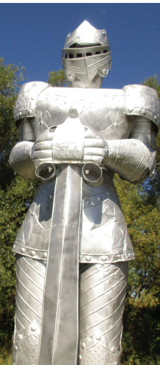
*A larger than life Knight in Shining Armor greets visitors to Castle Farms in Charlevoix.