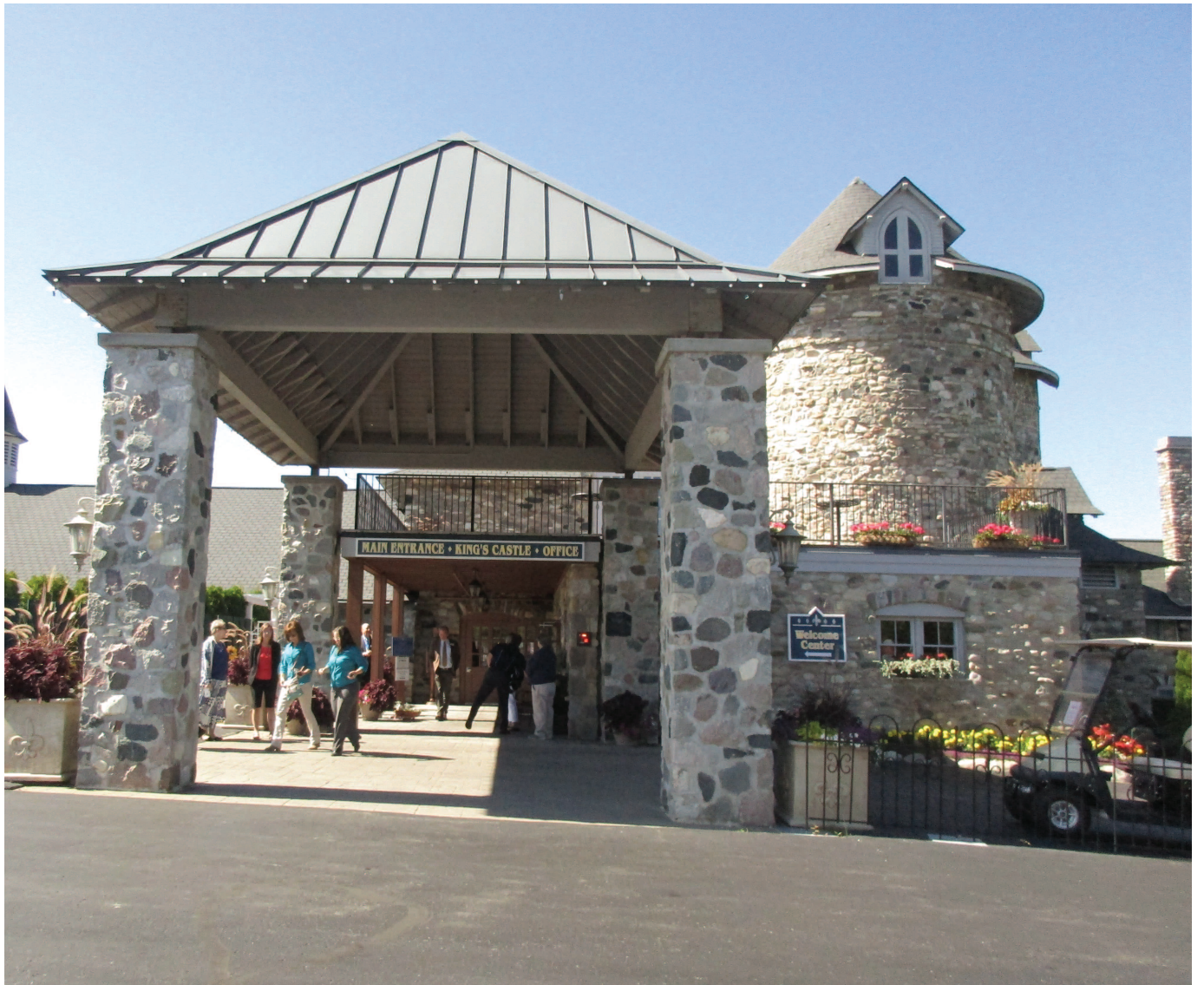
*Built as a model dairy farm in 1918, Castle Farms today has become a popular venue for weddings and other large gatherings. A 100 year anniversary celebration at the castle will kick off next week.

JULY 4 "Kids Day" All Day Bounce houses,